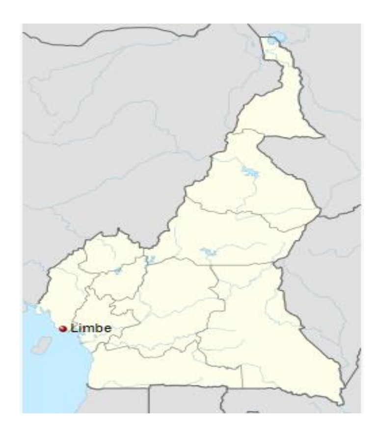
Figure 1: Location