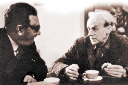
Abdus Salam with P.A.M. Dirac Cambridge University, 1965