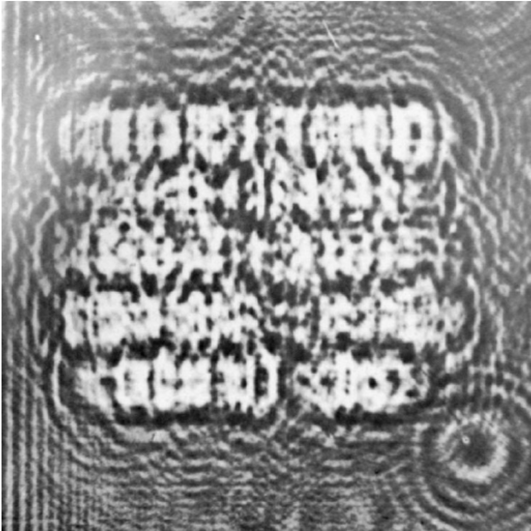
Reconstruction of Gabor's Holograms