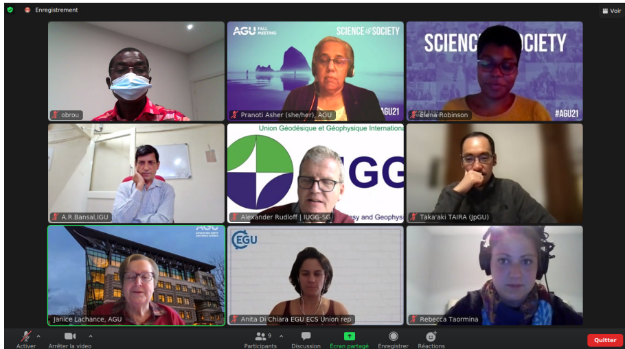
Figure: Meeting of AGU Monthly Leadership Call