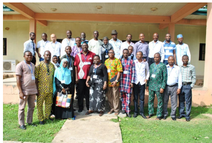
Figure: AGS Conference - 2014 in Abuja (Nigeria)