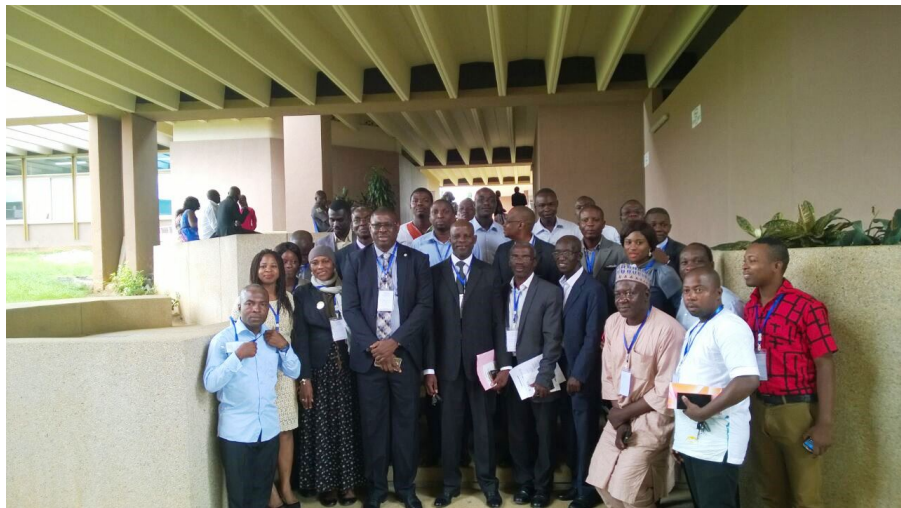
Figure: AGS-2016 Group photo