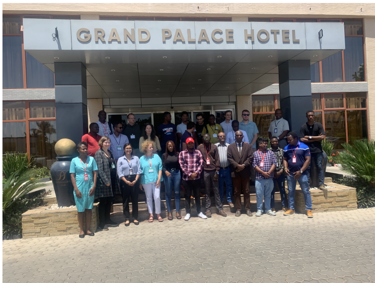
Figure: Group photo of the AGS -Conference 2023, 2-4 oct 23, Lusaka, Zambia