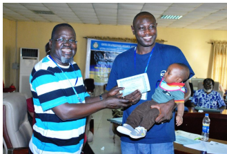
Figure: The youngest participant of the 1st AGS Conference receiving his certification of participation