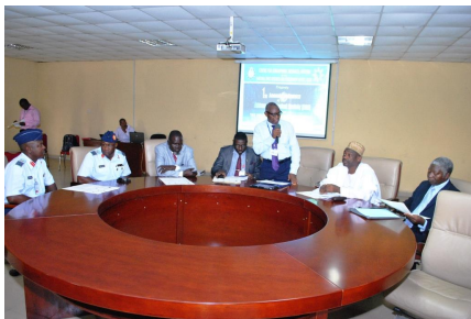
Figure: Opening ceremony of the 1st Conference, Abuja (Nigeria)

Since its creation in October 2012 in Addis Ababa, Ethiopia, we have organized and co-organized a series of conferences and schools and workshops.