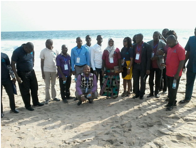
Figure: AGS-2016 Social activities. At the beach of Bassam