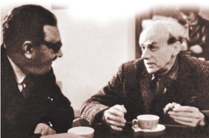
Abdus Salam with P.A.M. Dirac Cambridge University, 1965