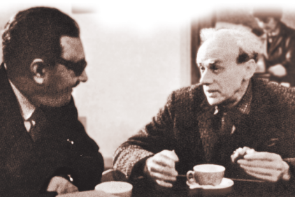
Abdus Salam with P.A.M. Dirac Cambridge University, 1965