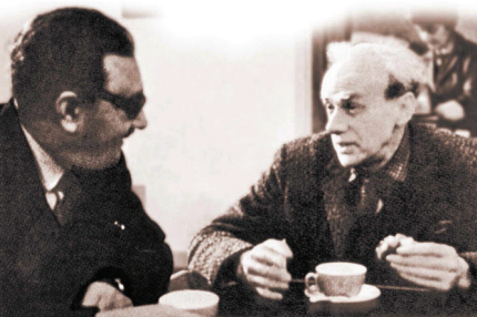
Abdus Salam with P.A.M. Dirac Cambridge University, 1965