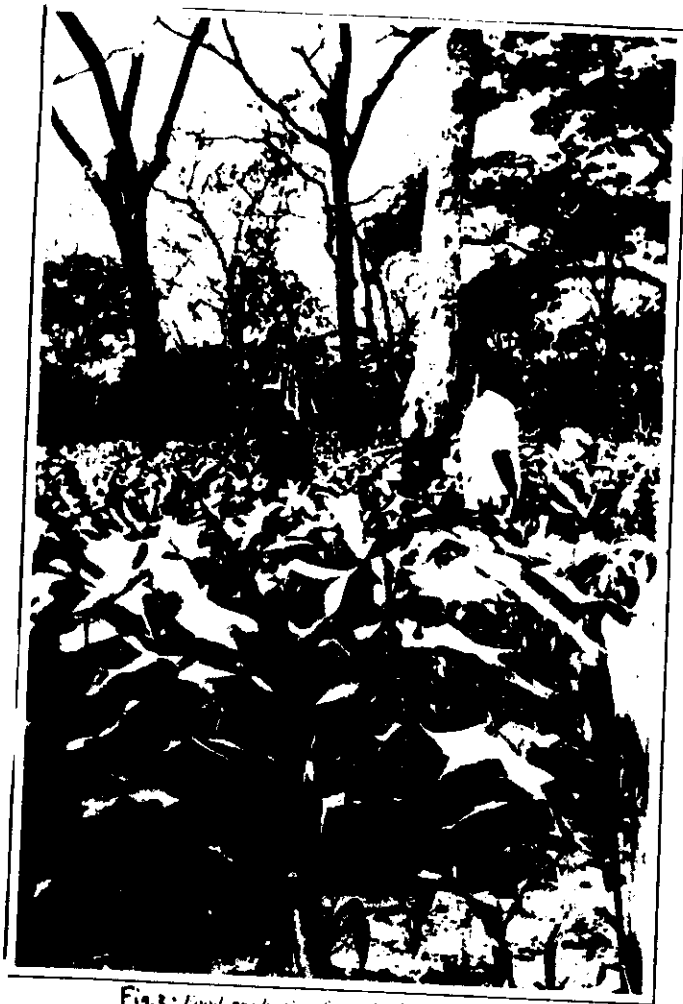
Fig. 1: Food production for a healthy nation.