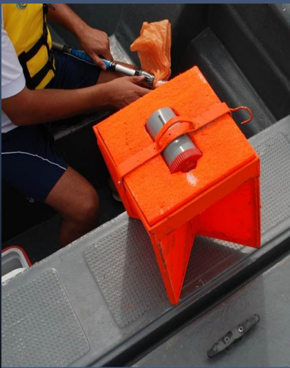
San Andrew cross type rip current meter with