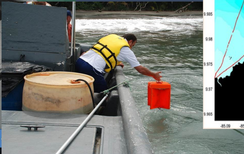
RCM just before it was released