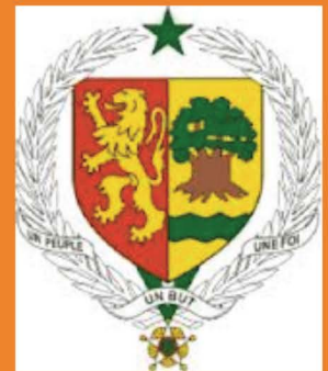
Ministère de l'Enseignement Supérieur et de la Recherche

The Abdus Salam International Centre for Theoretical Physics (ICTP) (SMR 2622), Strada Costiera 11, I-34151 Trieste, Italy Telefax: +39-040-2240-7455 - E-mail: smr2622@ictp.it